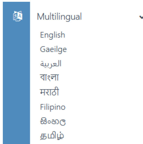
FIGURE 2. LANGUAGE TOGGLE

The language preference is saved in the internet browser. Select your preferred language again if your browsers cookies/cache are cleared. The language preference is not saved when using the internet browsers private browsing option.